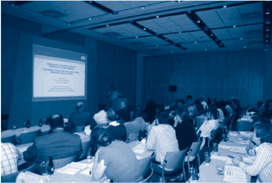
Sessions at the PAMMS 2007 Conference were well attended

of Cryptococcus species and the implication of the provision of antiretroviral therapy in AIDS patients with cryptococcosis (currently in Southern Africa the impact and death rate of cryptococcosis in HIV/AIDS remains extremely high); the occurrence and incidence of mycetoma in Africa, and the molecular identification of mycetoma causing agents; dermatophytes; barcoding of fungi, eg. black yeasts; as well as several other topics such as sporotrichosis, histoplasmosis, aspergillosis and mycotic diseases caused by less well-known fungi. As with the first meeting, this conference showed that Africa has much to offer in medical mycology, both clinically and scientifically, and once again accentuated the fact that health problems in Africa are still enormous.